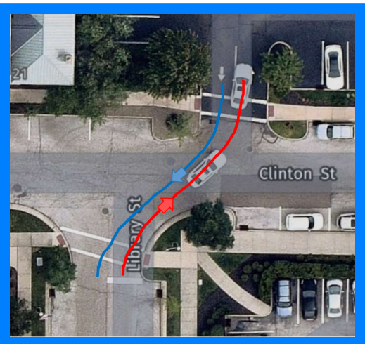
"S-PATTERN AT LIBRARY/WEST ENTRANCE"