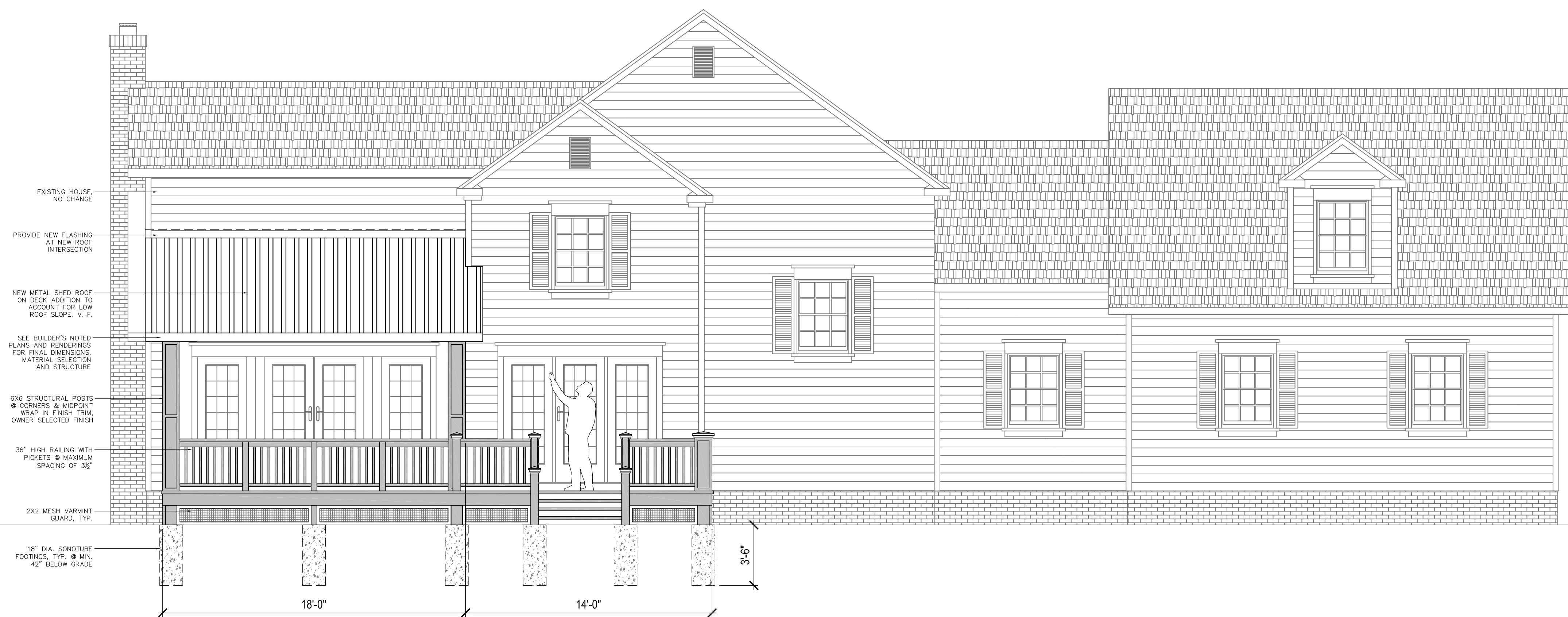
2 PROPOSED REAR ELEVATION SCALE 1/4" = 1'-0"

PERMIT #23-1109 New Deck with Partial Covering 7585 North Vinemont Court Hudson, Ohio 44236