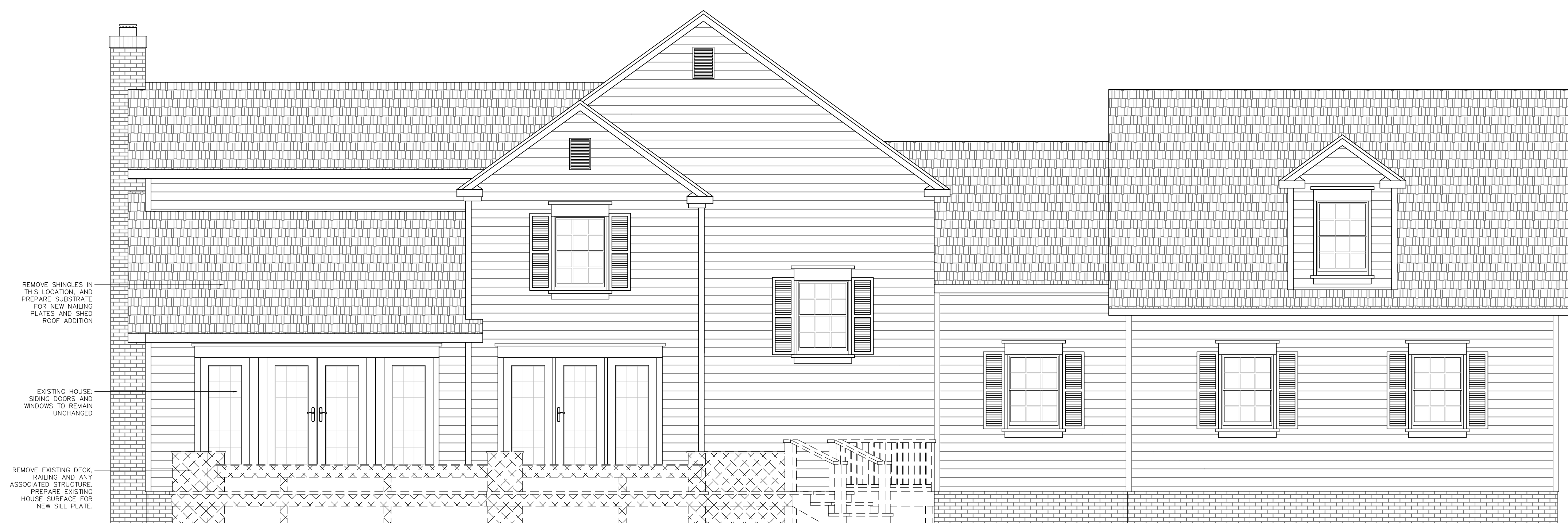
1 EXISTING REAR ELEVATION - DECK DEMOLITION SCALE 1/4" = 1'-0"