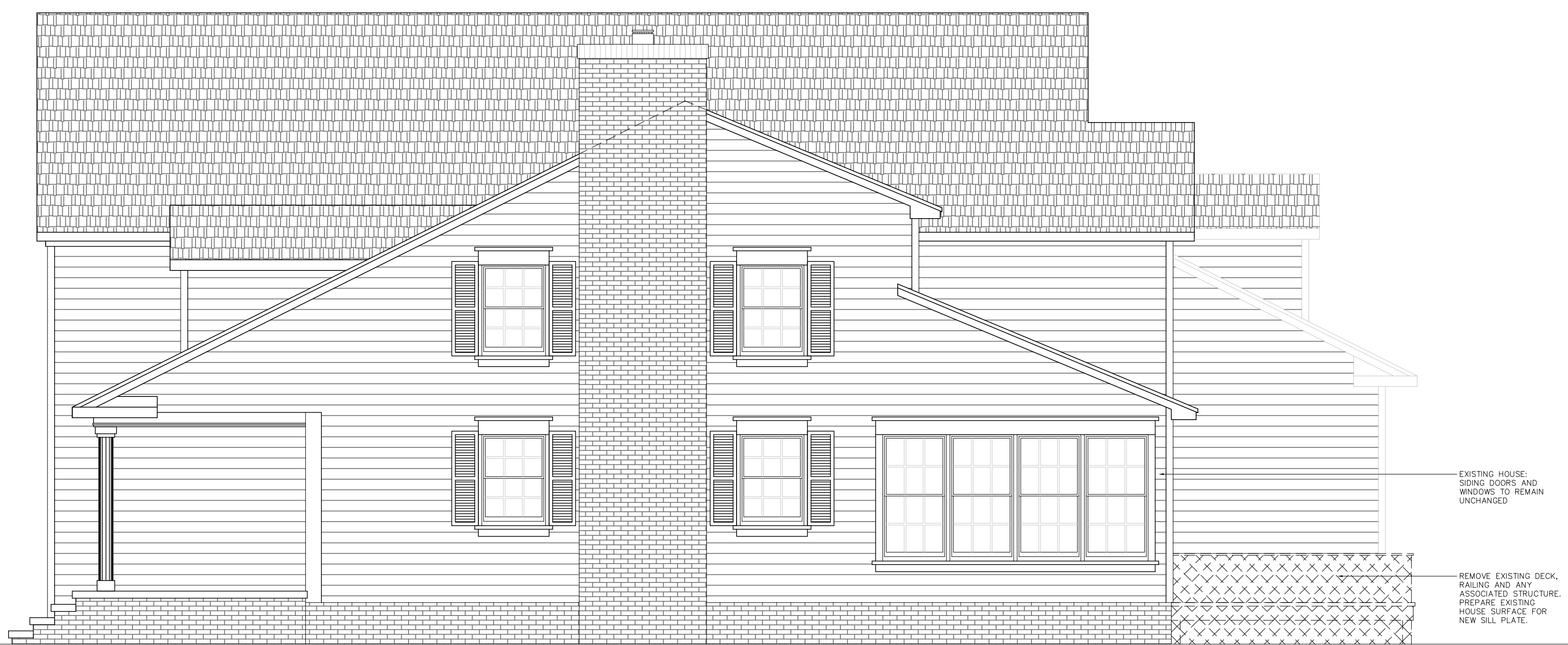
1 EXISTING SIDE ELEVATION - DECK DEMOLITION SCALE 1/4" = 1'-0"