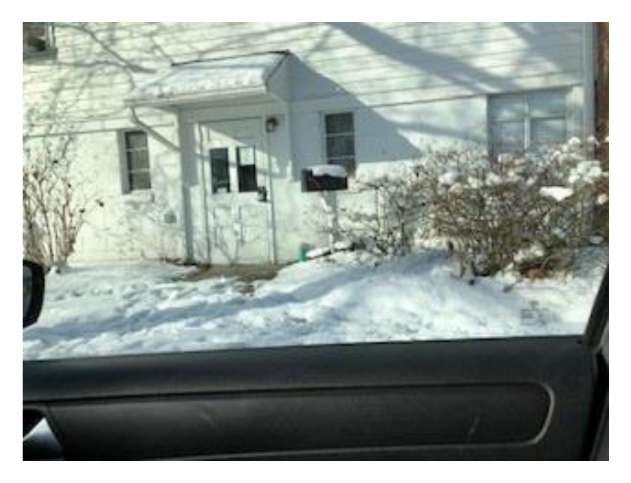
Figure 5 exterior entrance on College Street - side door