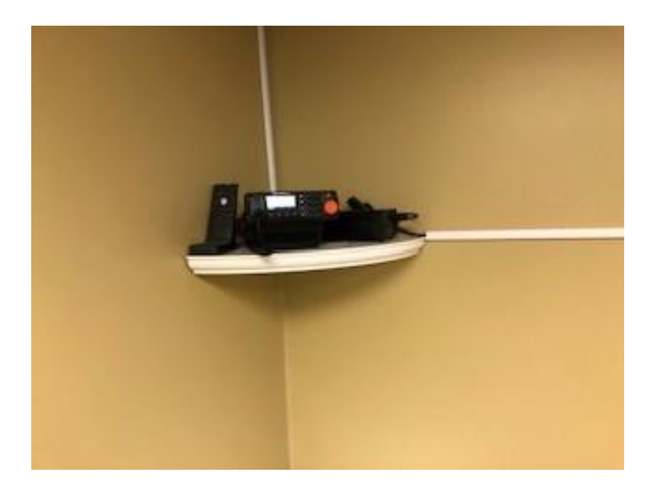
Figure 8 panic alarm