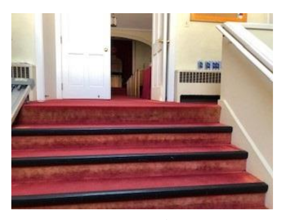
Figure 6 entrance to worship area