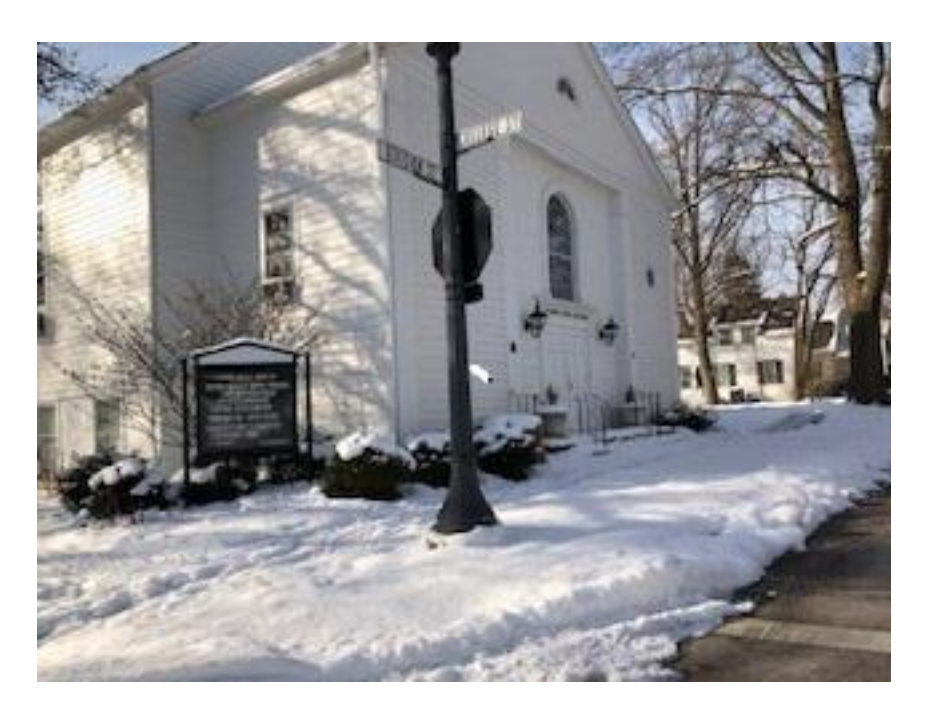
Figure 4 exterior view