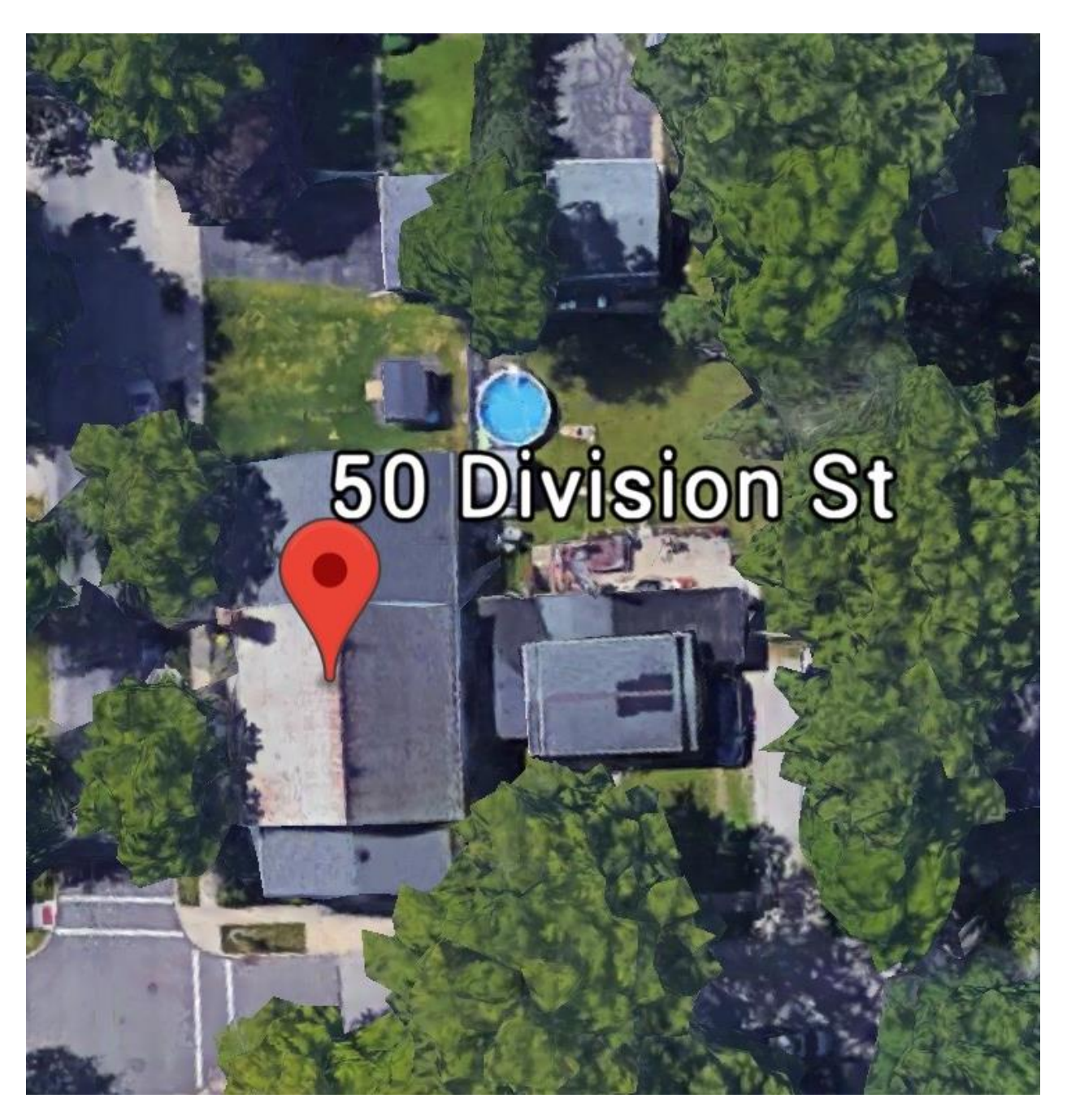
Figure 2 google earth view