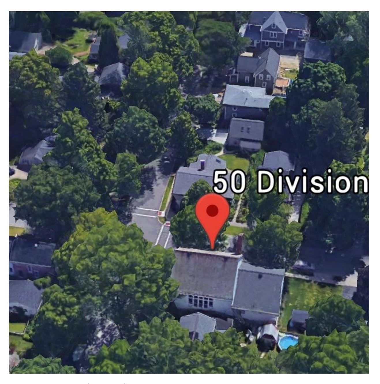
Figure 1 google earth view