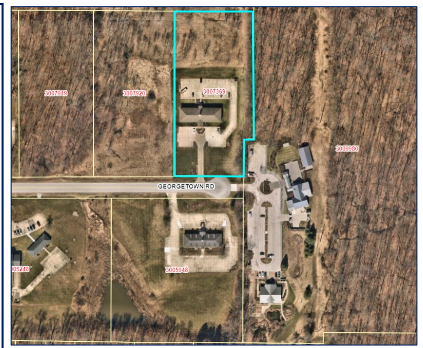
Location Map, City of Hudson GIS