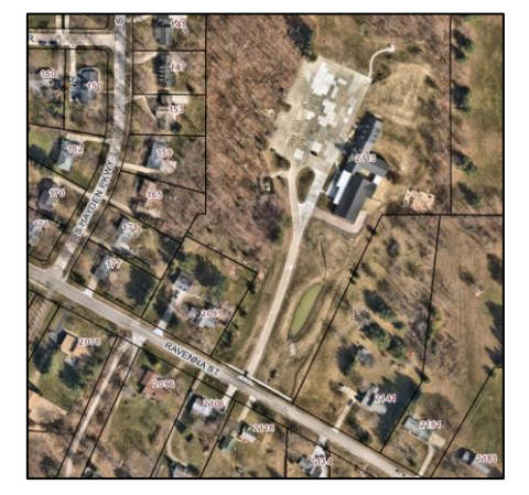
64 Ravenna St.- (From South Hayden to Stow Road)

<u>Gloria Dei Lutheran Church, 2113 Ravenna Street</u>: The Church constructed an addition in 2021. As part of the approval, sidewalks were installed along the property frontage. The city now anticipates completing this section of Ravenna Street in 2025 as part of the ongoing Walk and Bike Plan.