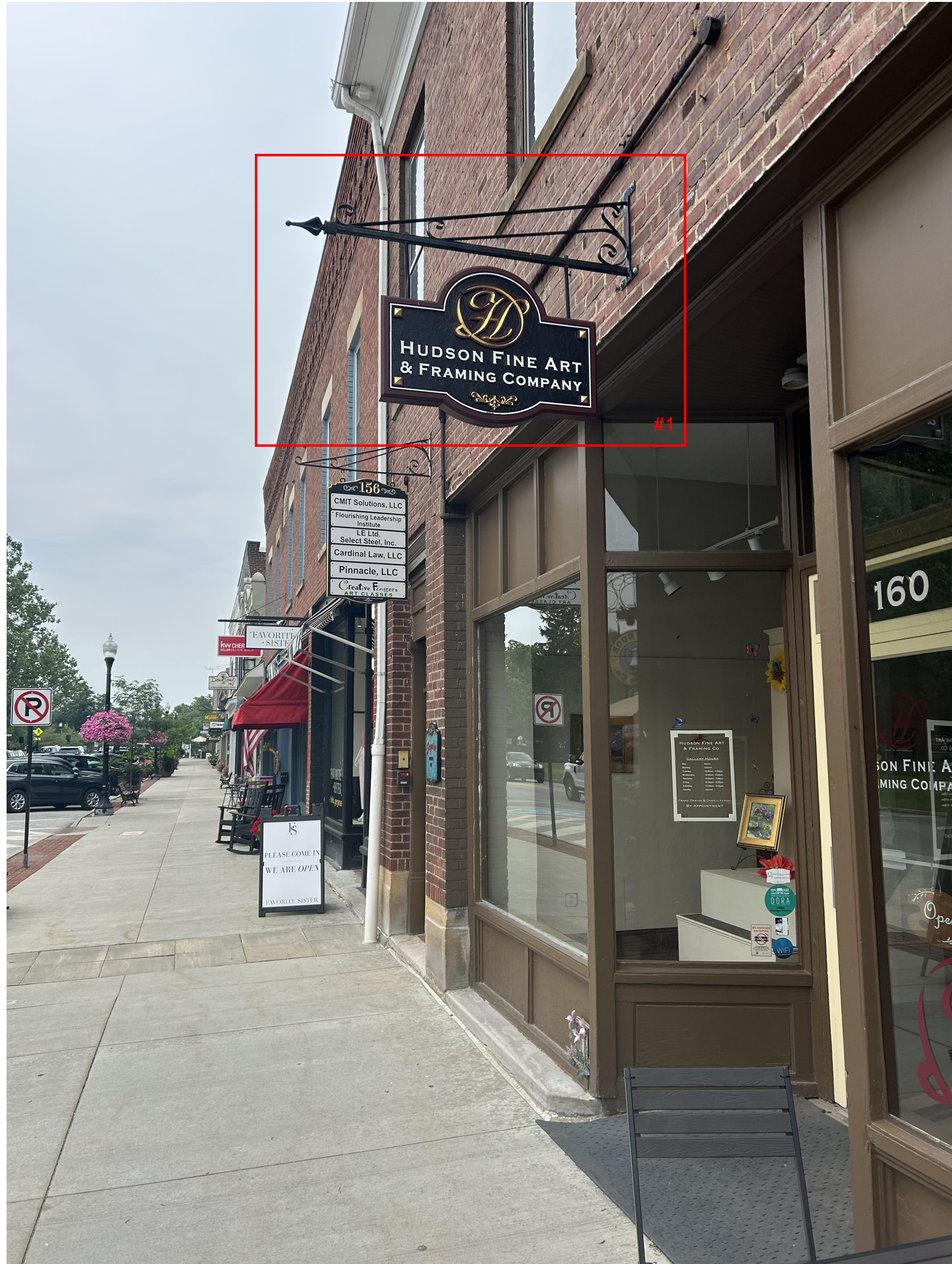
160 N. Main Front Entrance Side View. See Hanging sign (#1).