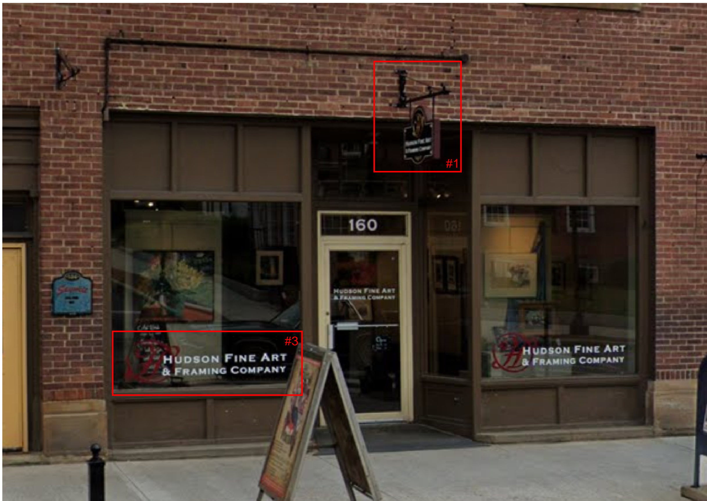
160 N. Main Front Entrance. See Hanging sign (#1) and Window Decal (#3).