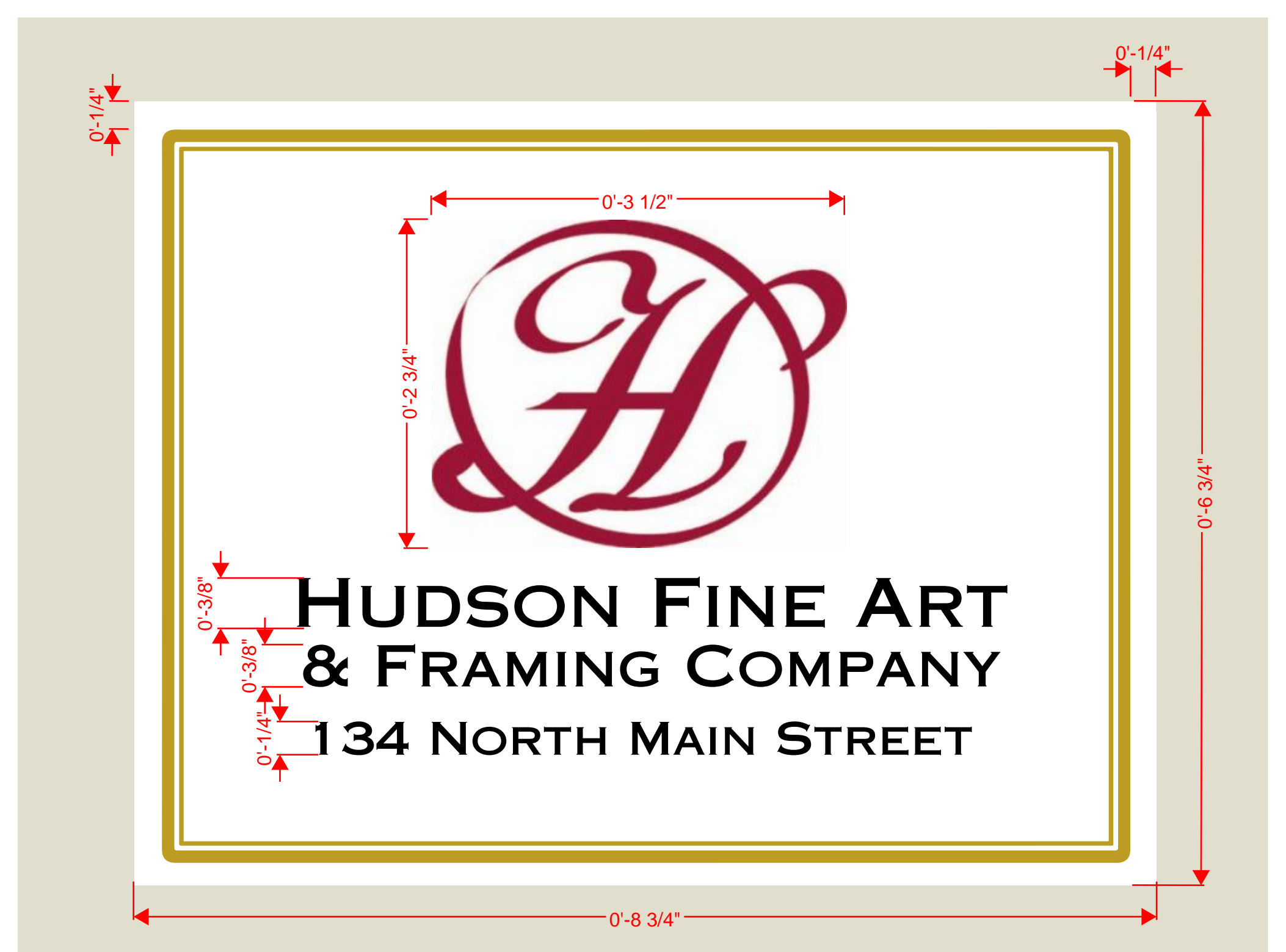
Proposed New Rear Plaque. (#5)

Proposed sign for rear entrance will be HDU material with matte finish