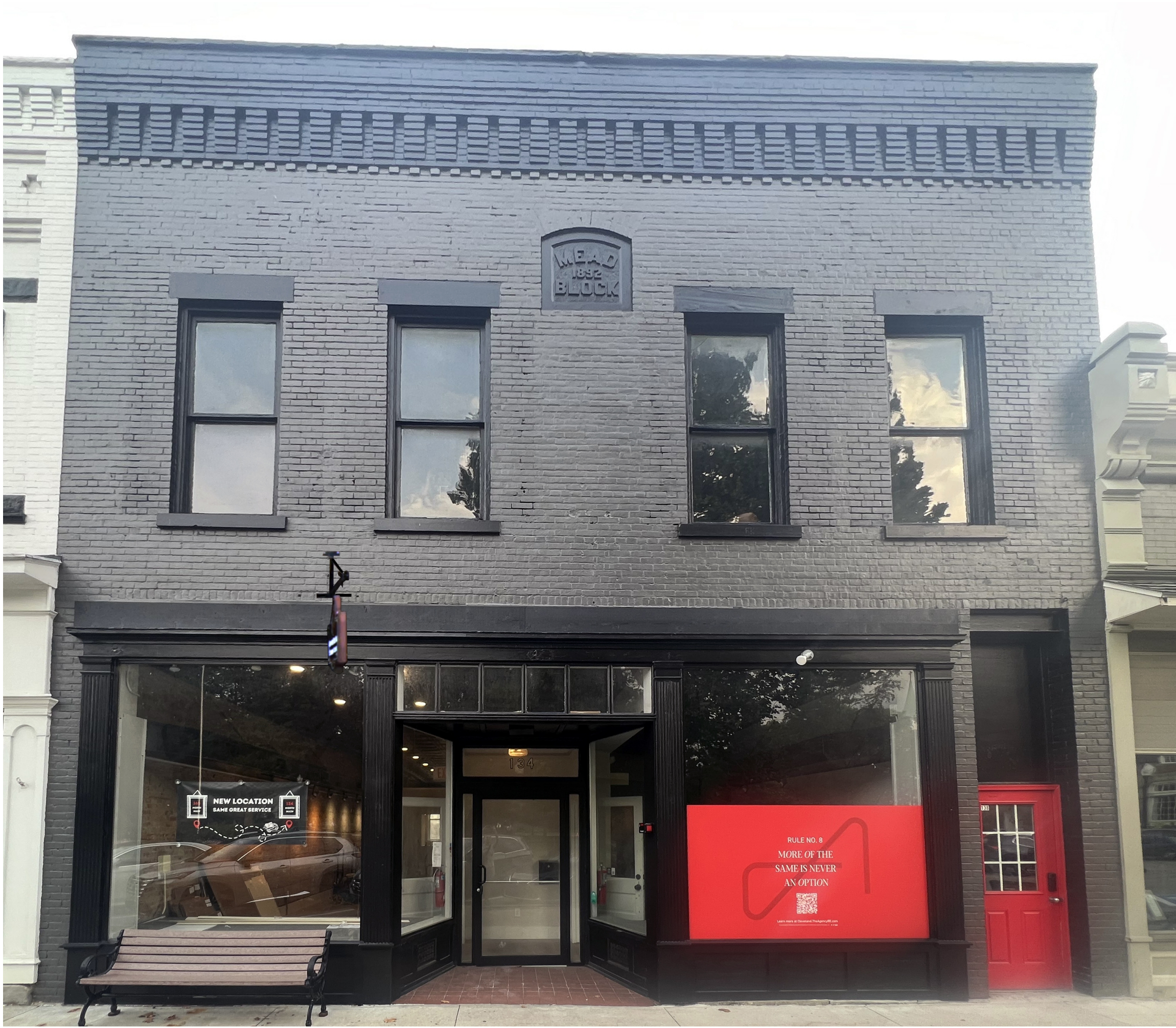
134 N. Main Front Entrance Front View. See Hanging sign (#1).