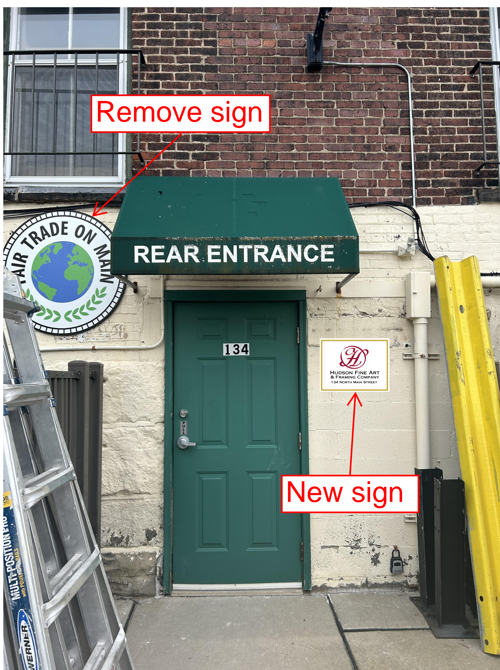
134 N. Main Rear Entrance. See Door Plack (#5).