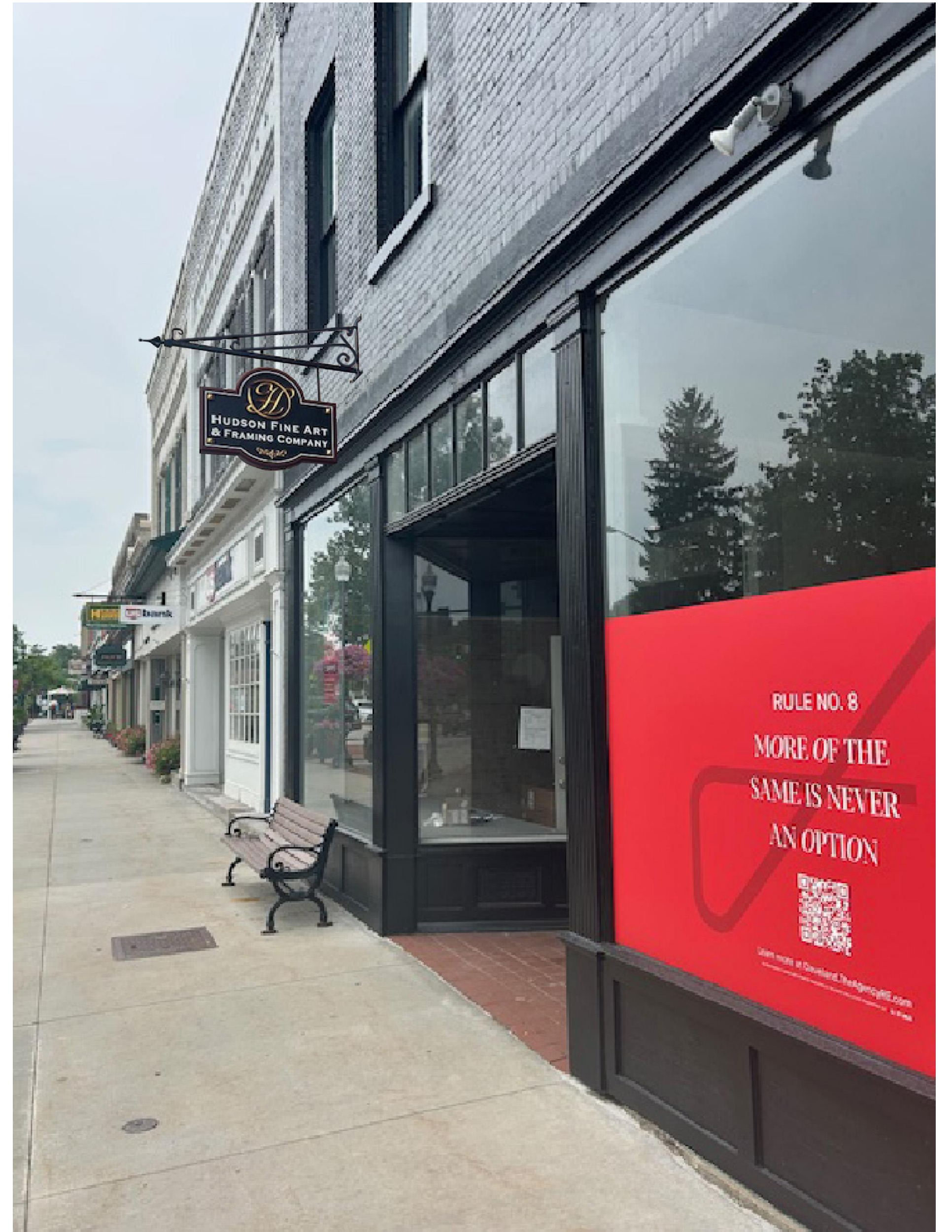
134 N. Main Front Entrance Side View. See Hanging sign (#1).