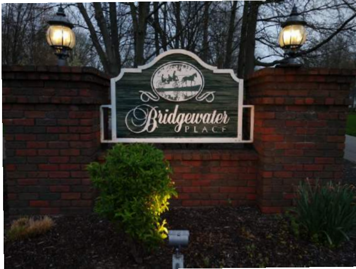
Existing Entrance Sign (42"H x 60"W x 1.5"D)