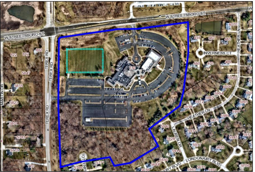
Existing Conditions, Hudson GIS