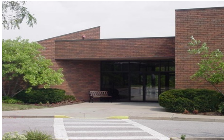
41 South Oviatt Street