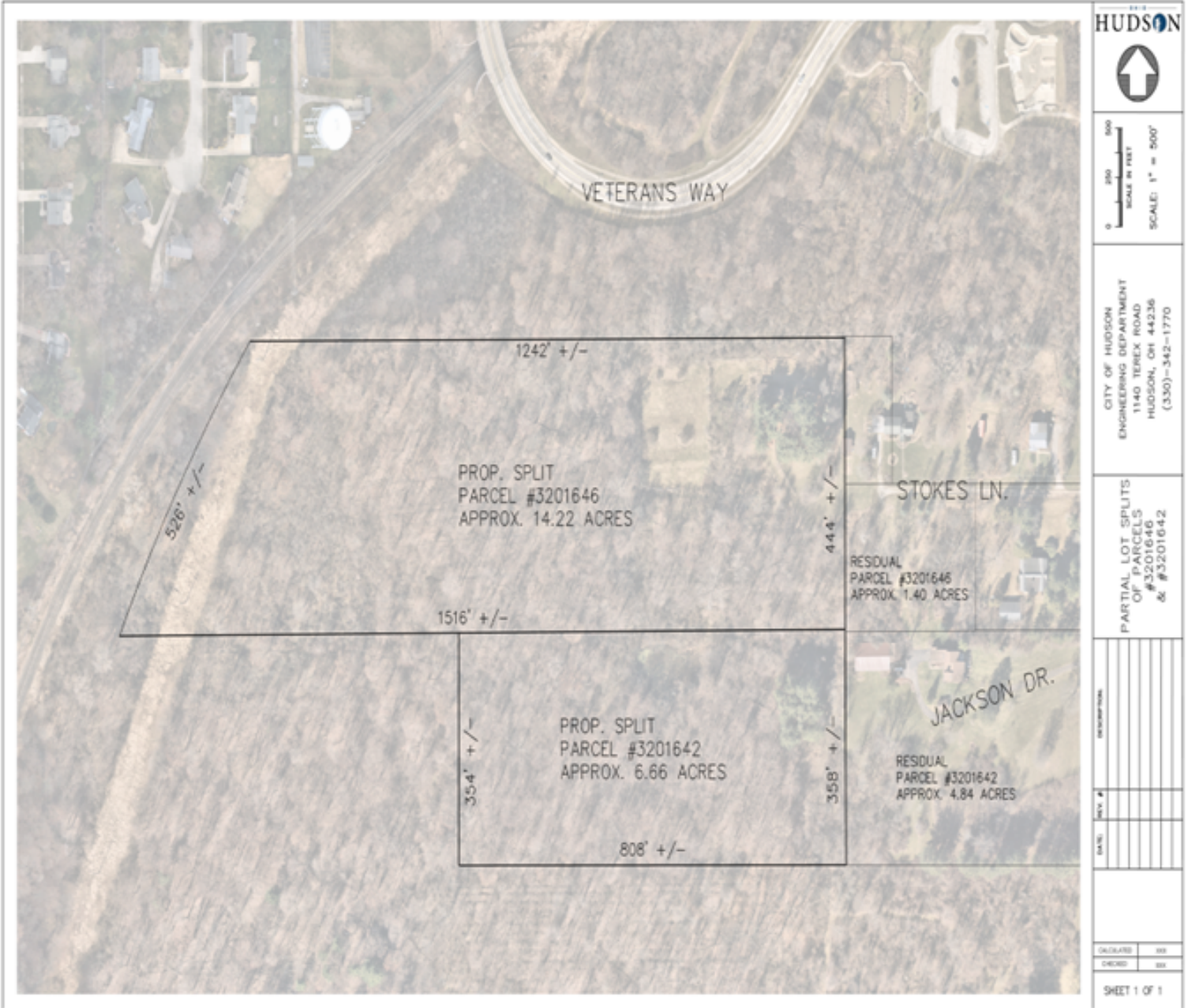
Exhibit A – Map of the subject area to be purchased.