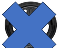
STANDARD PIU WHEEL