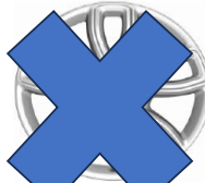
PNTD ALUM WHEEL (64E)