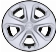
WHEEL COVER (65L)