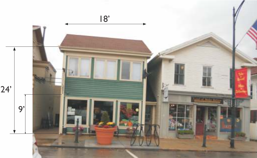
building is 15’ to the road

New Sign for CLE Social. In the basement of Dave’s Cosmic Subs