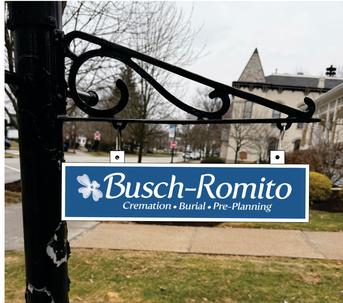
PHOTO RENDERING NTS

NOTE: due to printer limitations, colors shown may not exactly match specified. Refer to material charts for true colors.