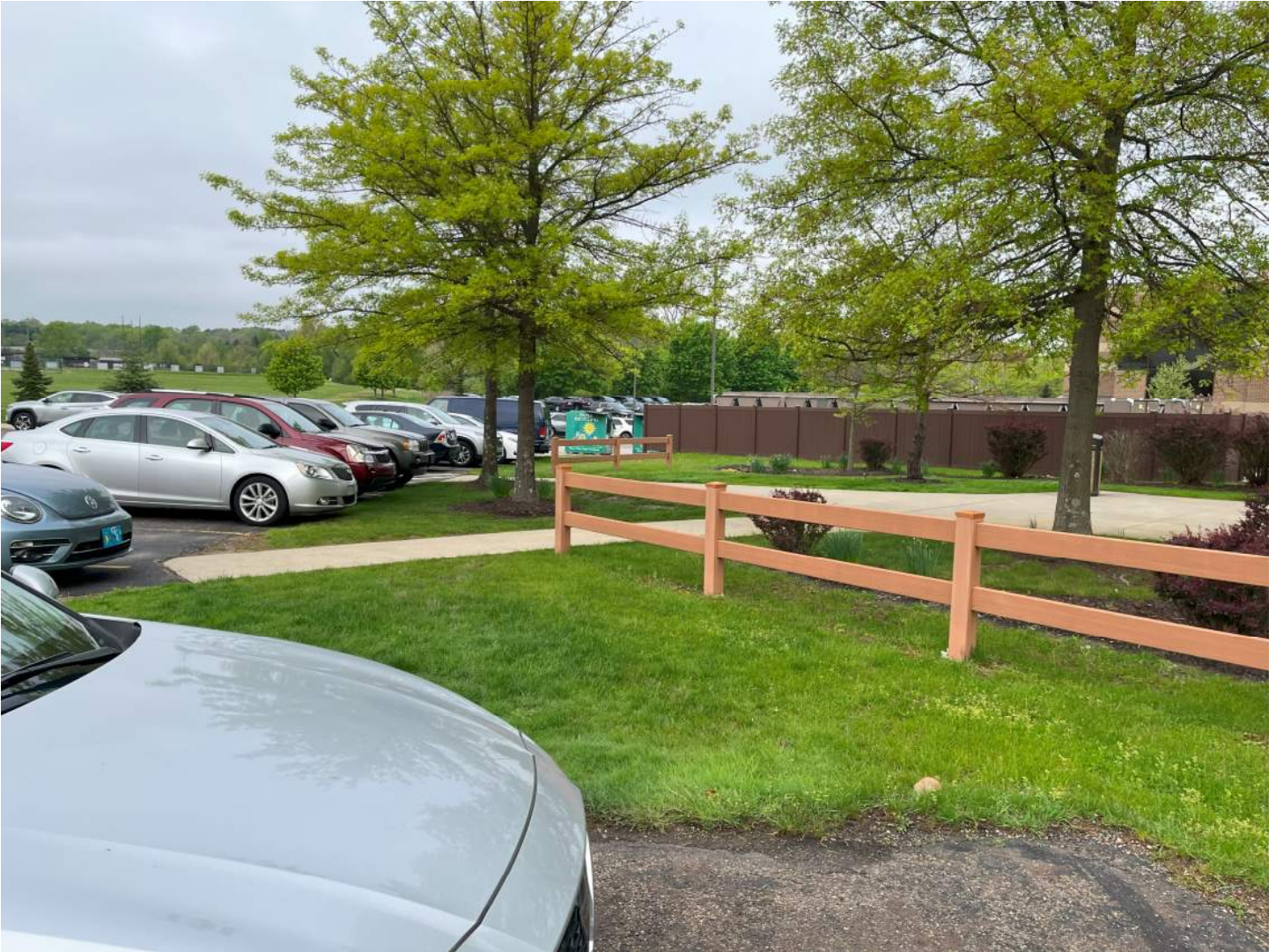
View looking west – parking/drive to the left, chiller enclosure to the right.