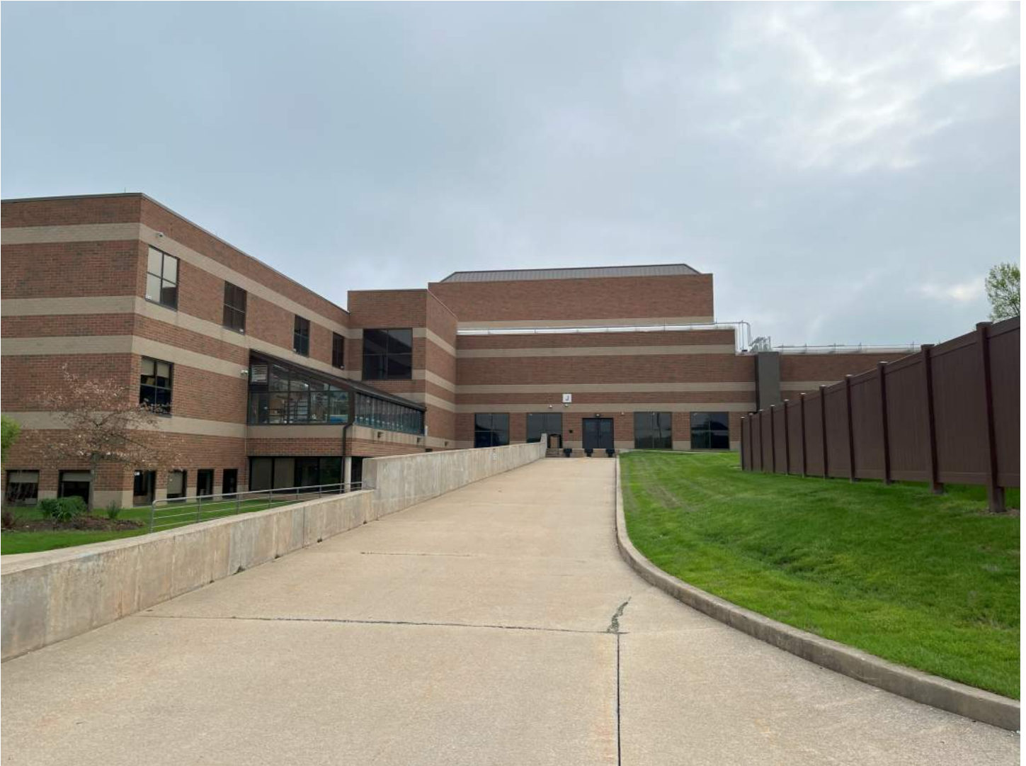
Looking northeast from the drive to the loading dock area. Chiller yard screen fencing to the right.