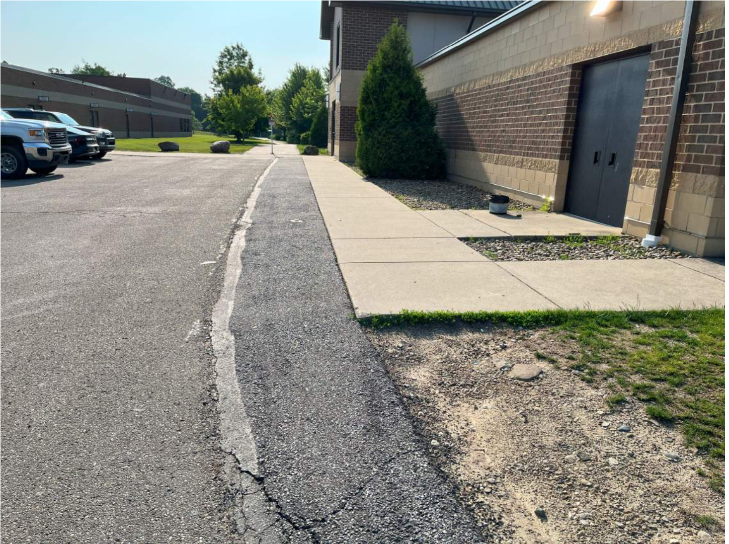
Concrete walk at Malson Athletic Center south of the Orchestra Addition and Carpentry/Graphic Arts Labs.