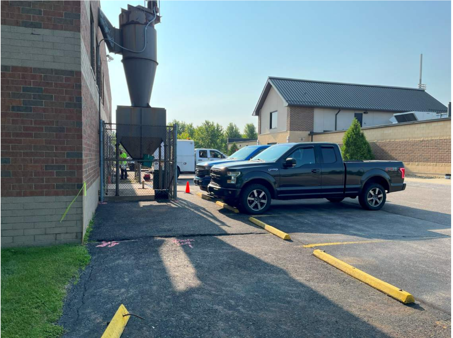
View looking east of the addition south of the Carpentry Lab where an existing fenced dust collection system is located as well as parking.