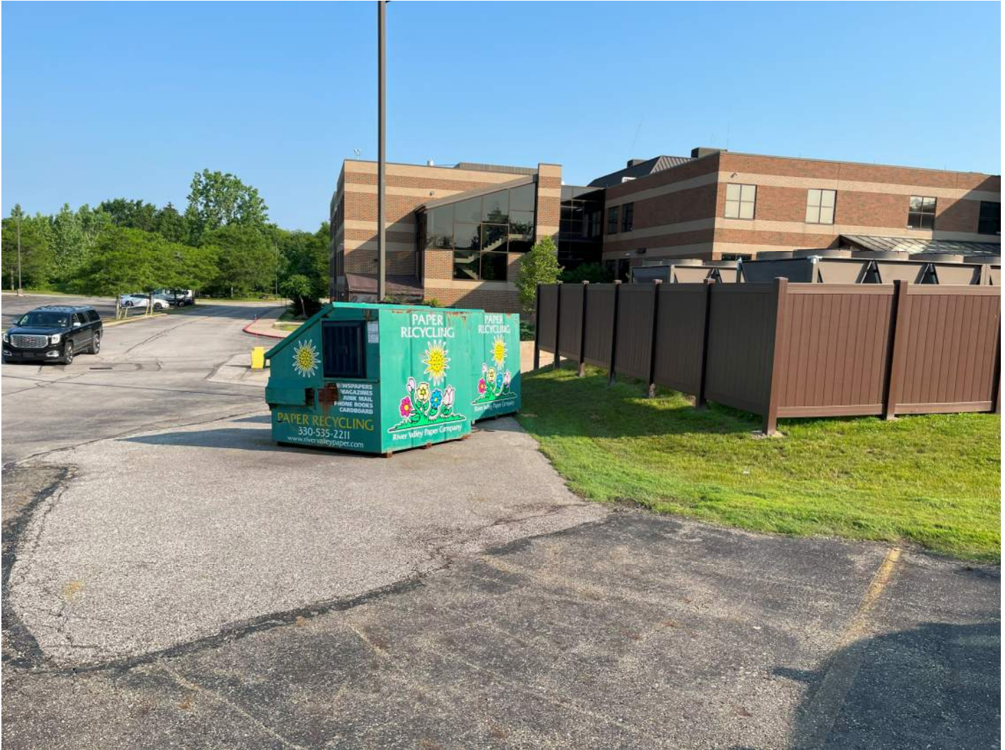
Existing recycling dumpsters – not a part of the project