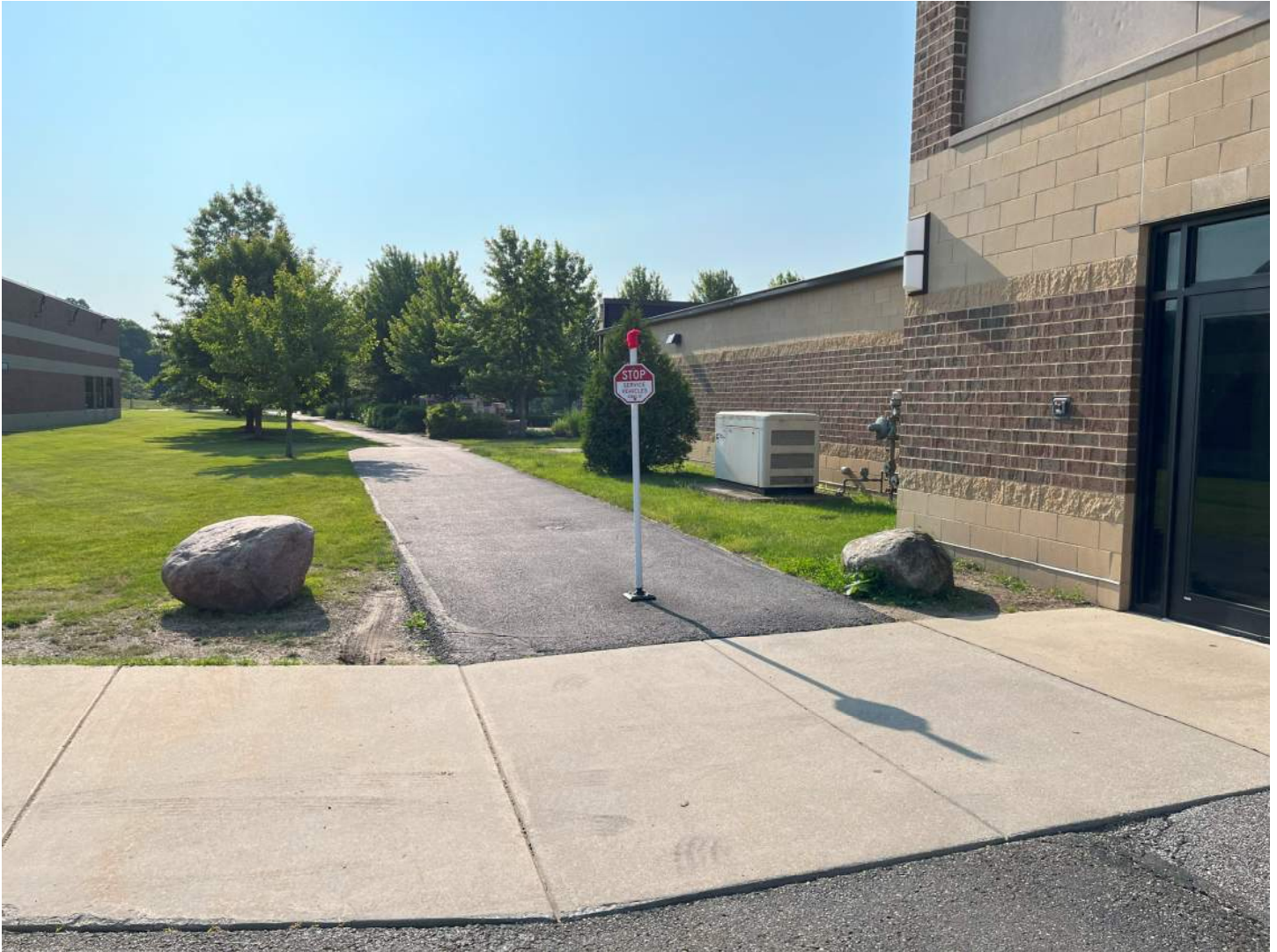
EMS access drive heading east between Hudson High School and Malson Athletic Center.