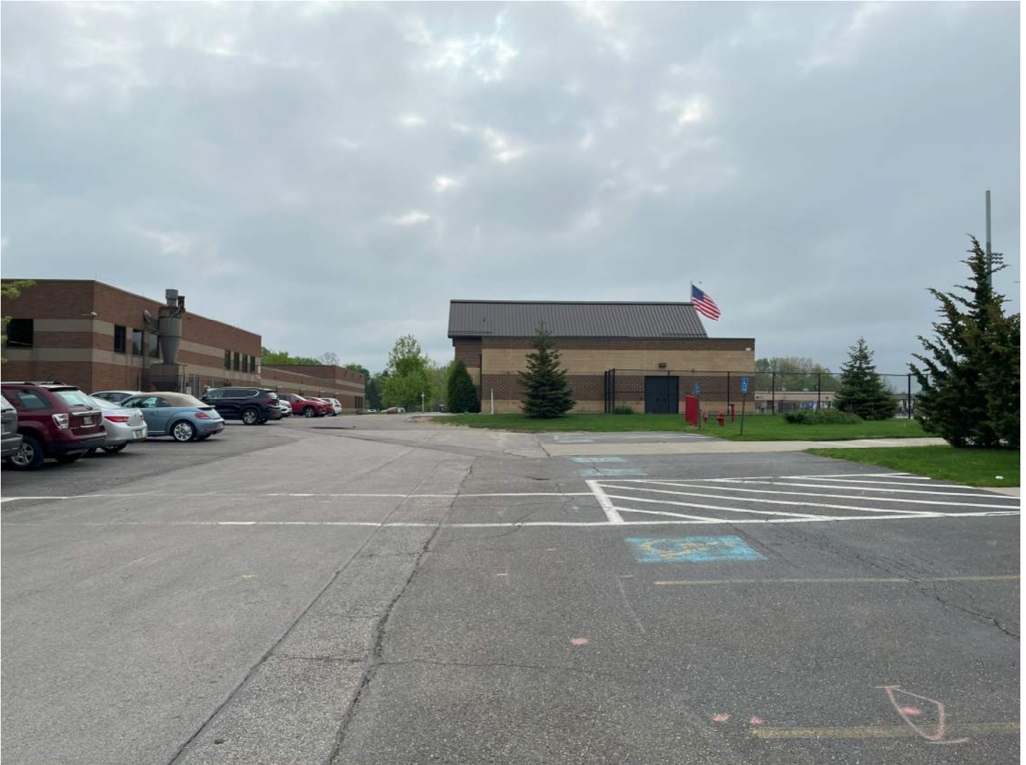
Looking east from the drive – Malson Athletic Center straight ahead, Hudson High School to the left.