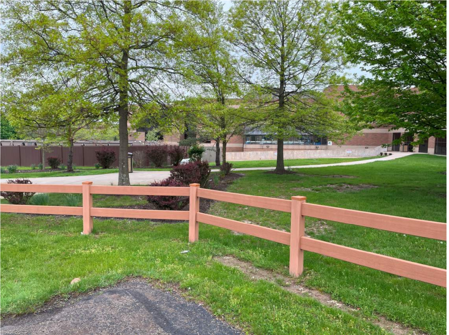
View looking northwest – orchestra addition will be to the right. A total of four (4) trees will be removed.