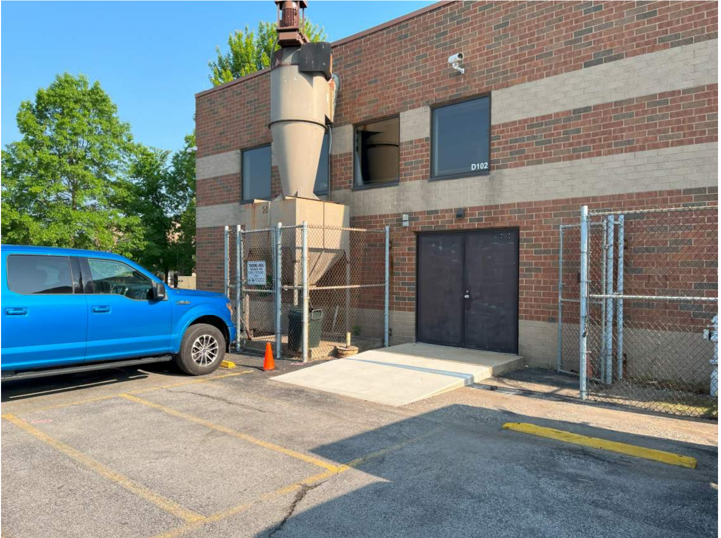
Concrete pad and apron at doors to Carpentry Lab.