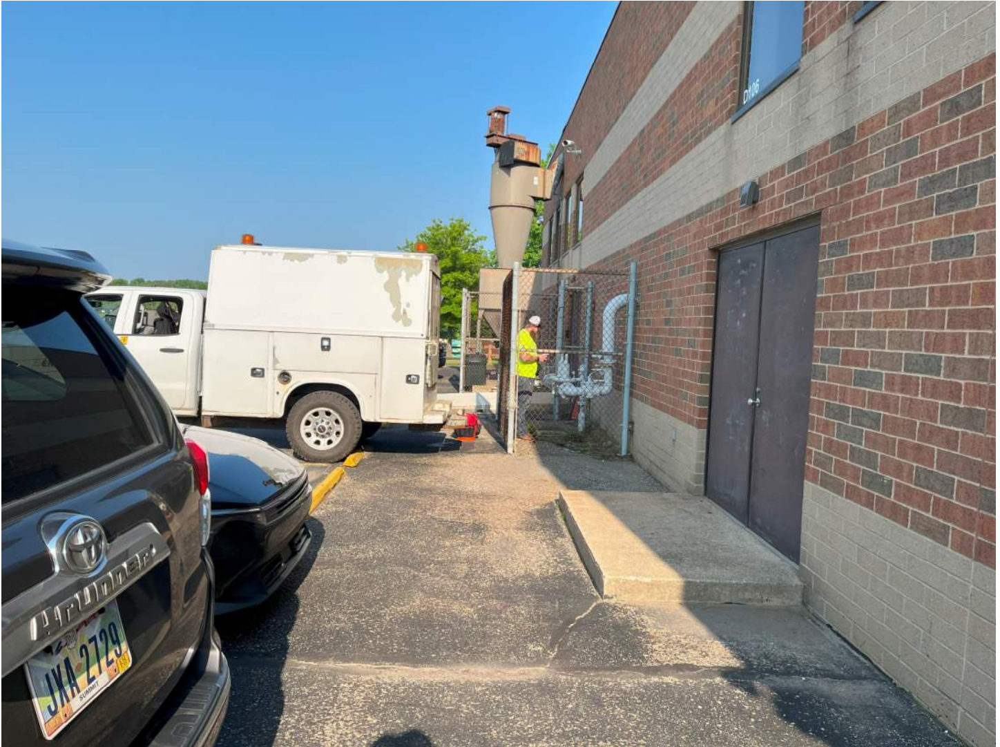
View looking west along south wall of Graphic Arts and Carpentry Programs. Existing entry concrete pads, dust collection system and gas service regulator are present as well as parking.