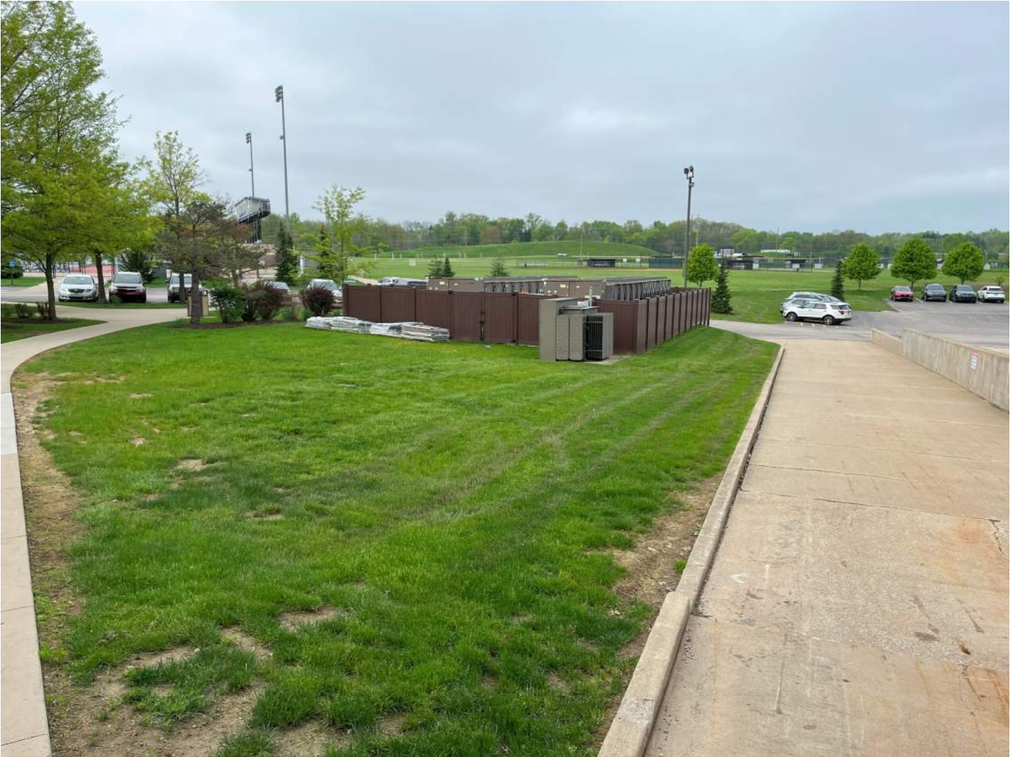
Looking south from the loading dock. The Chillers enclosure and related utilities are unaffected.