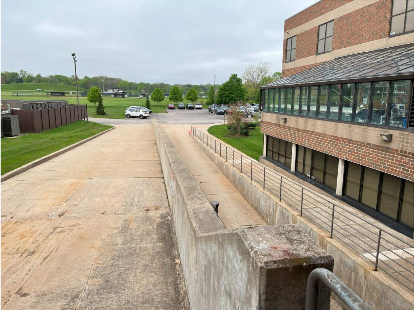
View looking southwest from the loading dock.