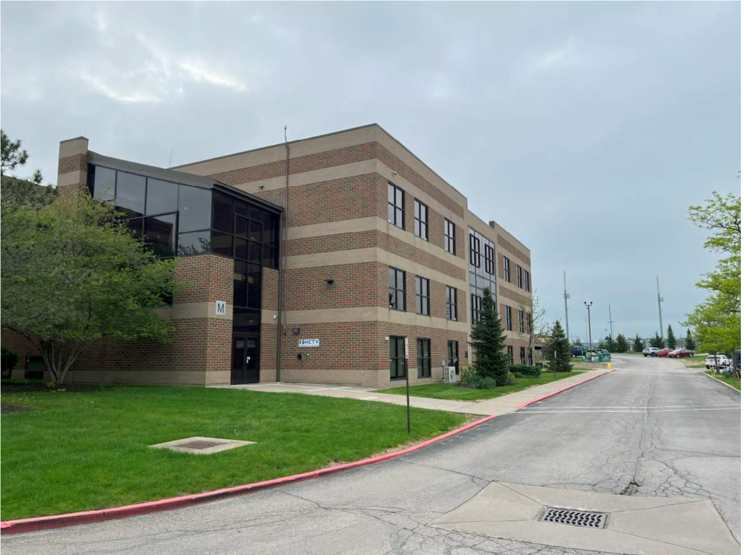
View looking southeast along the drive to the west side of the school by the staff parking lot.