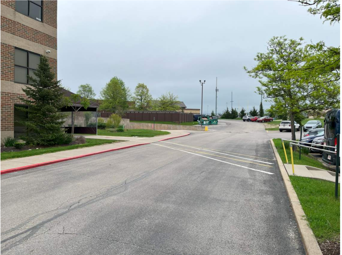
View looking southeast along the drive to the staff parking lot (on right) and Malson Athletic Center/Hudson Memorial Stadium in the distance.