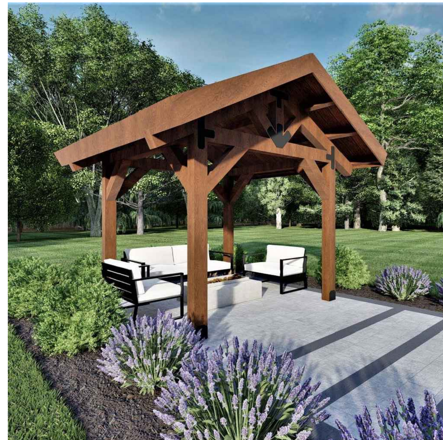
NOTE: IMAGE SHOWN FOR BASIS OF DESIGN. FINAL PAVILION PRODUCT MAY VARY PER OWNER APPROVAL.