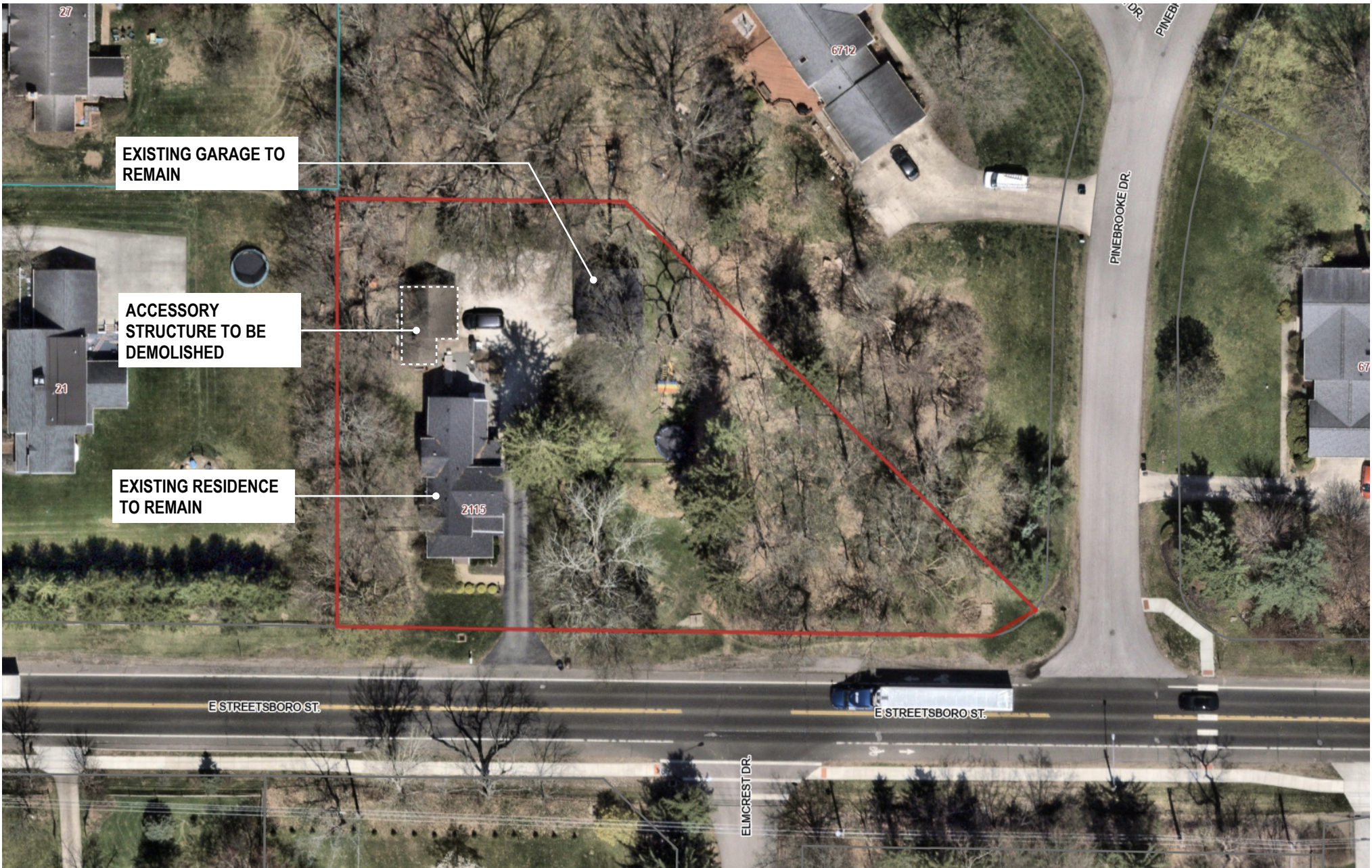
2115 EAST STREETSBORO, HUDSON, OHIO